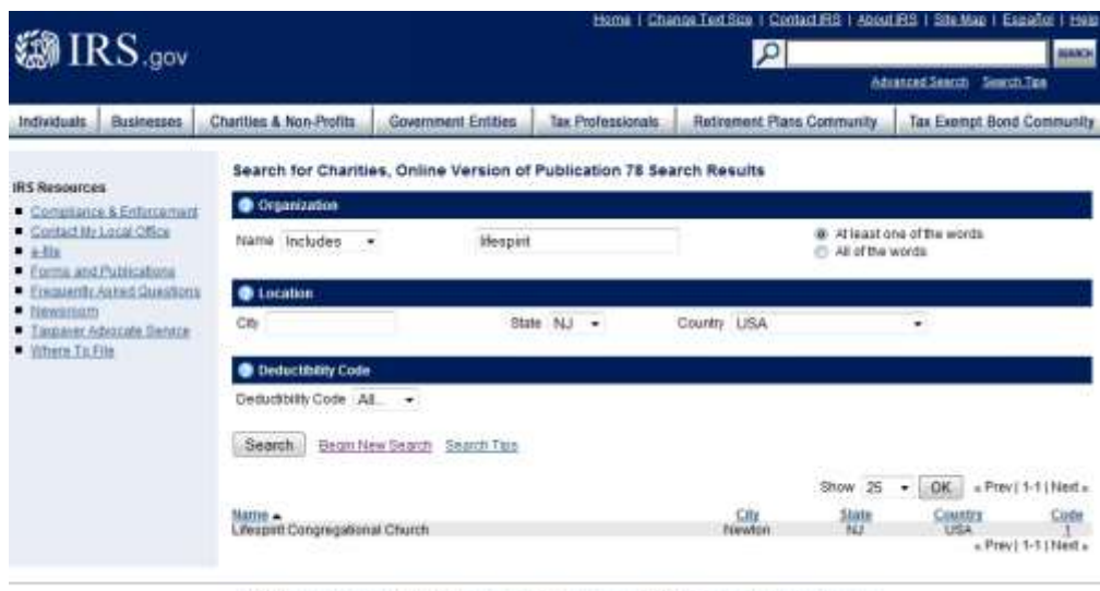
IRS Cumulative Listing of Exempt Organizations (IRS Pub. 78) Online Listing

Appealablish | Freedom of Information Act | Important Links | IES Privacy Policy | USA gov | U.S. Treasury