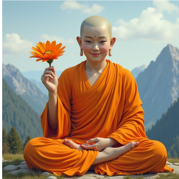
Buddha's Wordless Flower Sermon

Flower is perfect In the substance of itself; Though ephemeral.